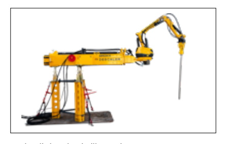
Hydraulic breaker in illustrations: BHB 55 Load and stability diagram available on request