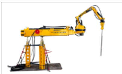
Hydraulic breaker in illustrations: BHB 55 Load and stability diagram available on request