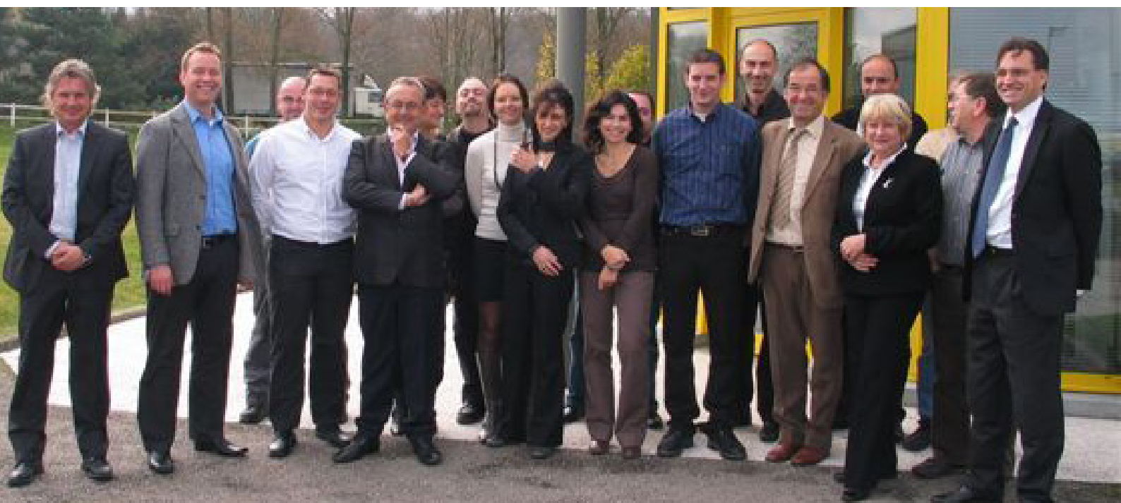
ATC's head office in Épinal, France.

Brokk has acquired its distributor in France, ATC BTP Industries. Brokk has established three new subsidiaries during 2010, including Brokk Australia and Brokk Italia earlier this year.