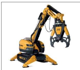
Hydraulic breaker in images: BHB 705. Concrete crusher in image: CC700. Load and stability diagram available on request